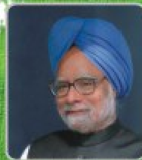
Dr. Manmohan Singh Hon'ble Prime Minister of India