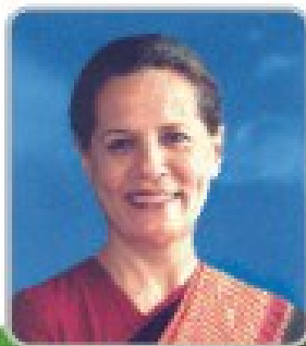
Smt. Sonia Gandhi Hon'ble Chairperson, UPA

The Government guarantees 100 days of employment to every rural household that demands work.