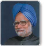
Dr. Manmohan Singh Prime Minister of India