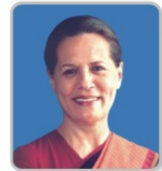
Smt. Sonia Gandhi Chairperson, UPA

Dedicated to Building a Strong and Prosperous India BHARAT NIRMAN