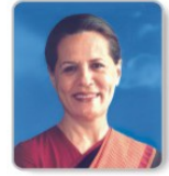
Smt. Sonia Gandhi Chairperson, UPA

Dedicated to Building a Strong and Prosperous India BHARAT NIRMAN