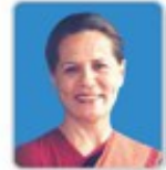
Smt. Sonia Gandhi Chairperson, UPA