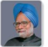
Dr. Manmohan Singh Prime Minister of India